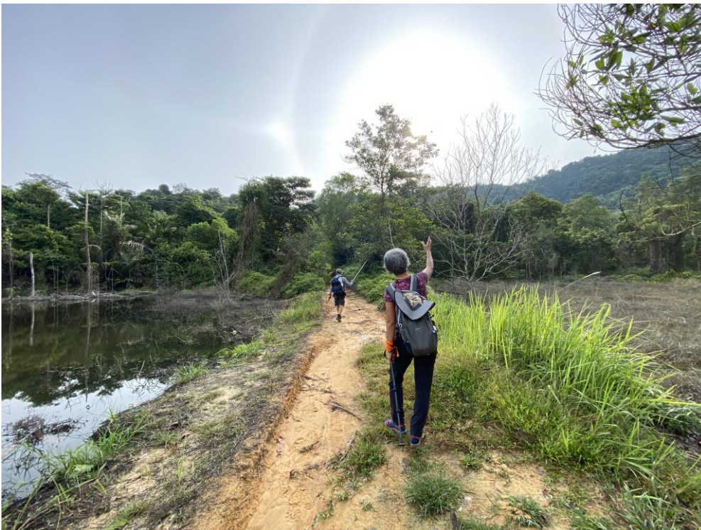
Hikers enjoying nature in Shah Alam Community Forest