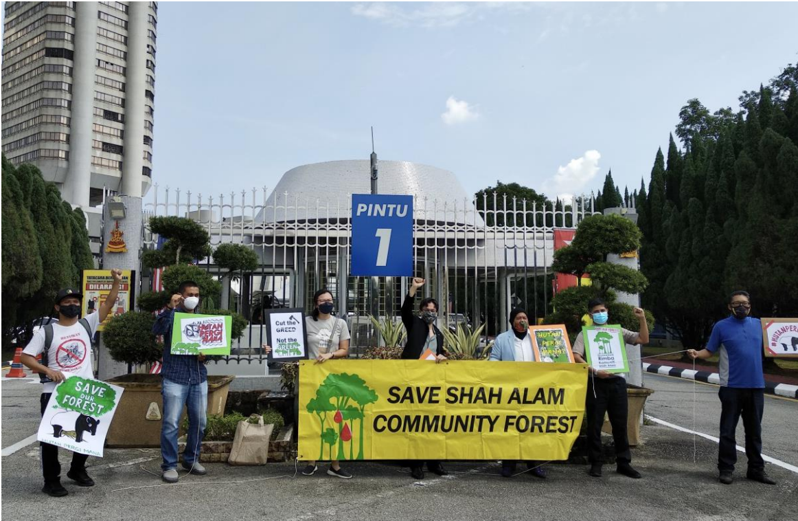
Protest outside SUK on 13 October 2021

Persatuan Rimba Komuniti Shah Alam Shah Alam Community Forest Society (PPM-036-10-01032016) shahalamforest.org | sacfsociety@gmail.com