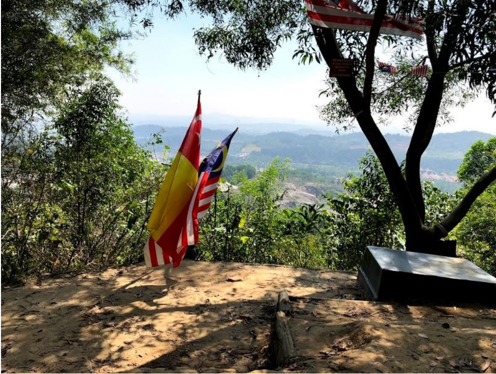
Peak Garden, highest point in Shah Alam Community Forest and Bukit Cherakah Forest Reserve

Persatuan Rimba Komuniti Shah Alam Shah Alam Community Forest Society (PPM-036-10-01032016) shahalamforest.org | sacfsociety@gmail.com