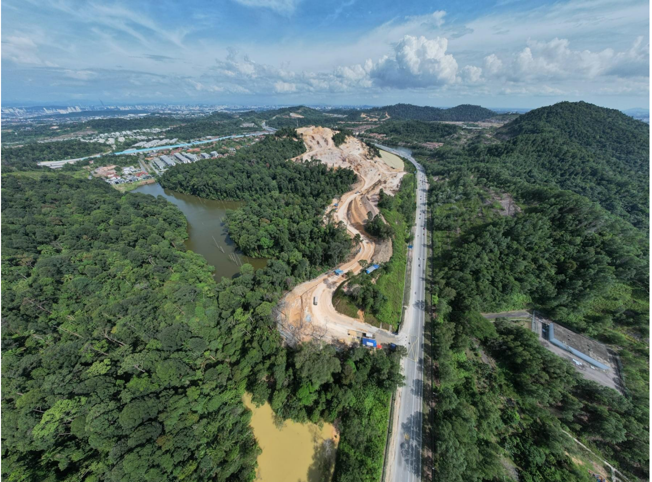
Ongoing forest destruction of the Bukit Cherakah Forest Reserve beside Perdana heights (compartment 35).

Persatuan Rimba Komuniti Shah Alam Shah Alam Community Forest Society (PPM-036-10-01032016) shahalamforest.org | sacfsociety@gmail.com